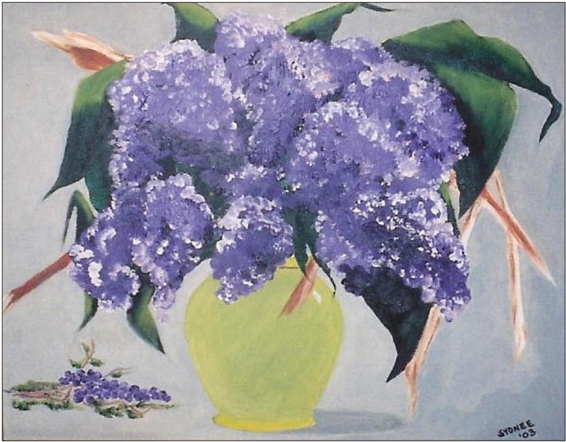
Flowers Illustration by Syd