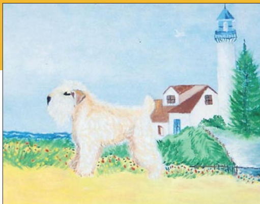
Beach Illustration by Syd

To learn about support groups, services, research centers, clinical trials, and publications about AD, contact the following: